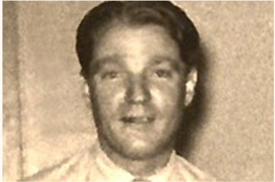
RENATO LEVI Only surviving photo.

In large part, this is perhaps due to the reason that Levi's story doesn't fall into the narrative of a "hero spy," and efforts to make him into one mean eliding much of the truth. To be absolutely certain, Levi was of paramount importance in establishing a spy network in Cairo that "turned the tide" of WWII in North Africa. But for much of WWII (specifically, August 2, 1941- October 17, 1943), Levi was either undergoing interrogation by the Italian authorities or in an Italian island prison. 3