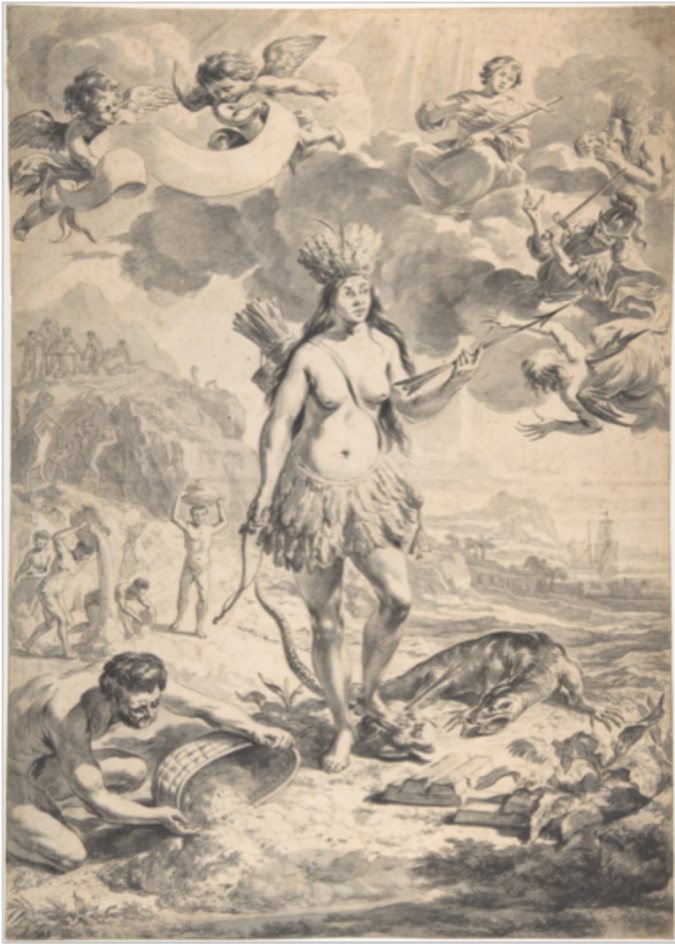
ALLEGORY OF AMERICA Nicolaes Berchem, Mid-late 17th century

the hammock, reveal her to be more vulnerable in this exchange.