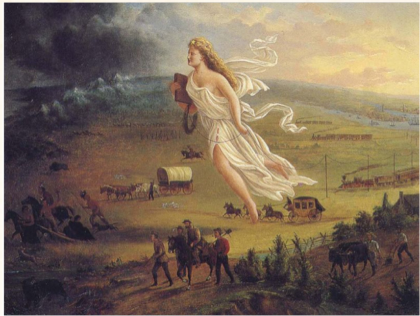
SPIRIT OF THE FRONTIER John GAST, 1872

destiny, while still portraying characteristics of femininity and purity. Gast's painting was originally created for George Croffutt, who published popular travel guides for the west. In Croffutt's New Overland Tourist and Pacific Coast Guide , Croffutt explains the image, writing that it "represents the United States' portion of the American Continent; the beauty and variety, from the Atlantic to the Pacific Ocean, illustrating at a glance the grand drama of Progress in the civilization, settlement, and history of this country." Columbia "carries a book – common school – the emblem of education and the testimonial of our national enlightenment, while with the left hand she unfold and stretches the slender wires of the telegraph, that are to flash intelligence throughout the land." 10