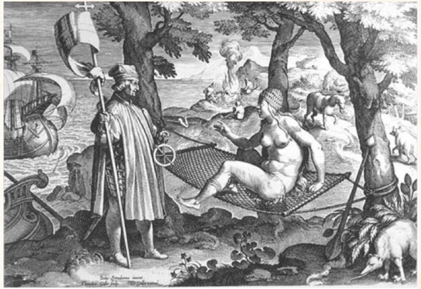
THE DISCOVERY OF AMERICA Theodor Galle, replica after Johannes Stradanus, Ca. 1600