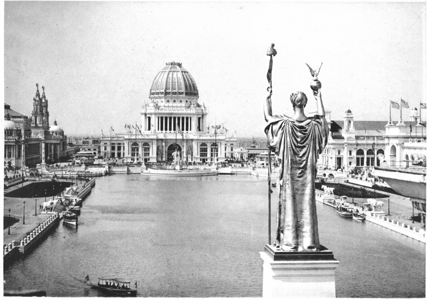
LOOKING WEST FROM PERISTYLE.

At the turn of the century, in 1893, Chicago hosted the World's Columbian Exposition, also known as Chicago's World Fair. The fair was held to celebrate the 400th anniversary of Columbus reaching America. It was also a showcase for Chicago, which won the right to host the fair over New York City and had just rebuilt its city after the Great Chicago Fire. Over 26 million visitors came to the fair to see the latest technological advancements of the time, as well as art and entertainment. 18 The great feats on display included the ferris wheel and the exhibits in the Electricity Building, including electric moving sidewalks, elevators, and the telephone. 19 In a 1893 guide to the fair, the Electricity Building is described with extreme praise: "The Electrical Department of the Columbian Exposition will be a revelation to even those who attribute almost miraculous powers to the great force. A hundred thousand incandescent lamps placed harmoniously about the grounds and buildings, and 10,000 arc lamps distributed advantageously to light up the beautiful architecture and pleasing landscape, would alone furnish almost a fairy spectacle; but combine with these, electric fountains, pointing rainbow sprays towards the sky, glittering lamps of many colors sparkling under the clear waters of the lagoons and at night setting out in all their dainty colorings the floral beauties and the most brilliant kaleidoscope will fade in an every-day dull contrast." 20