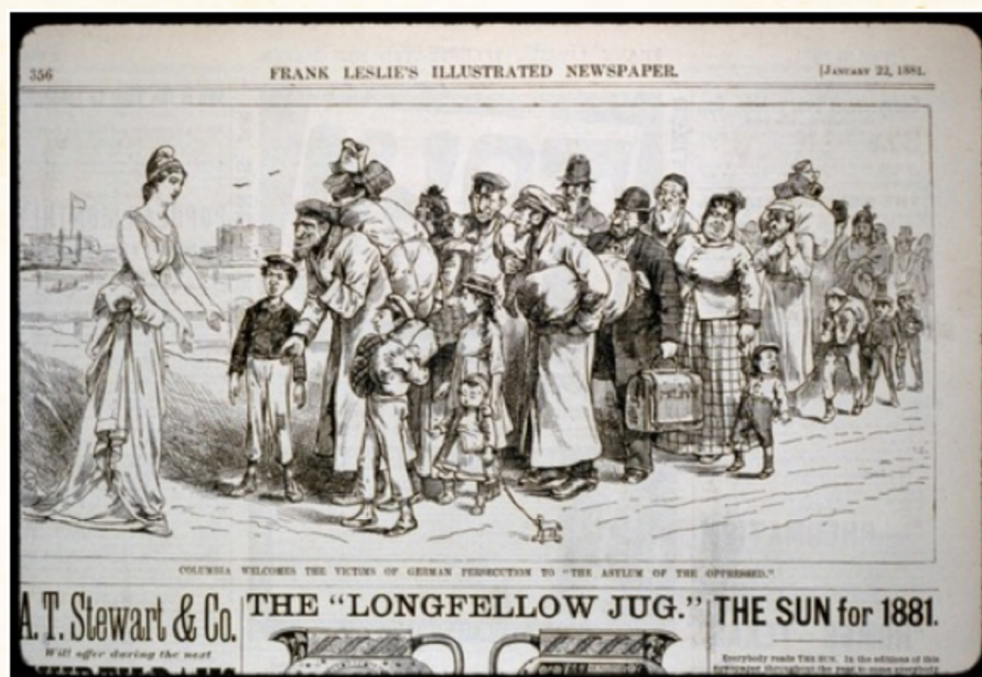
Frank Leslie's Illustrated Newspaper, January 22, 1881. The caption reads: "Columbia welcomes the victims of German Persecution to "The Anthem of the Oppressed."

In 1881, Columbia welcomes German immigrants: 15 (top right)